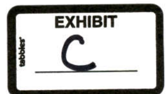
Image ID Filing Description A0458-5460 Renewal