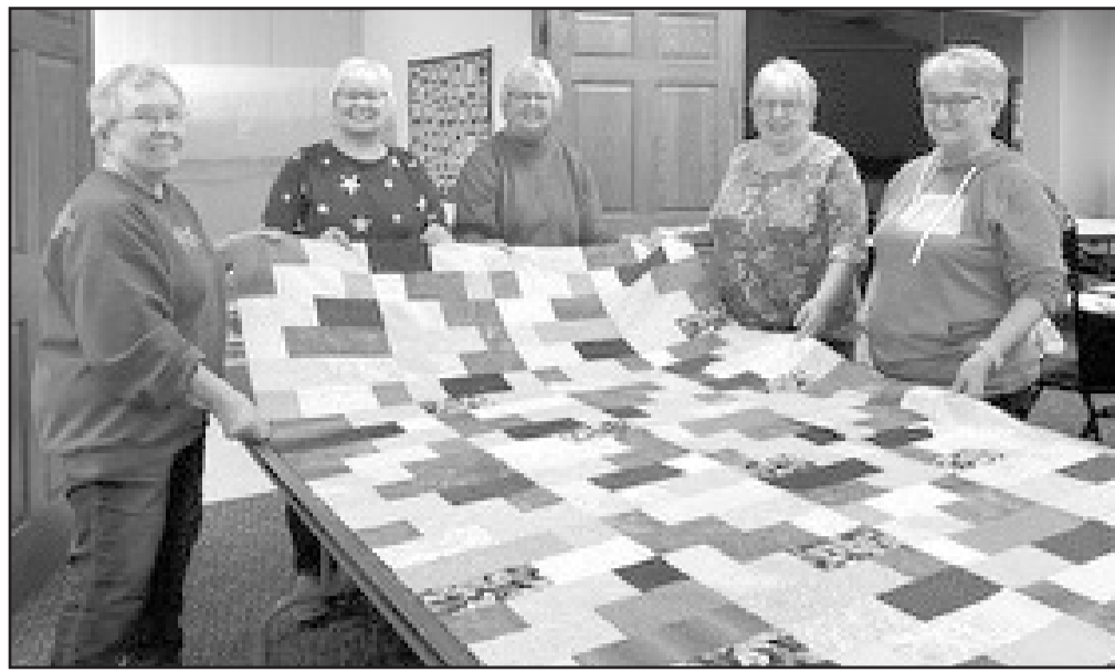
Faithful and "Sew Busy" Quilters.

feature a craft, bake sale and gift baskets. The baked goods will include Norwegian goodies (lefse and krumkake), donuts, breads, cookies, bars, home canned items and more.