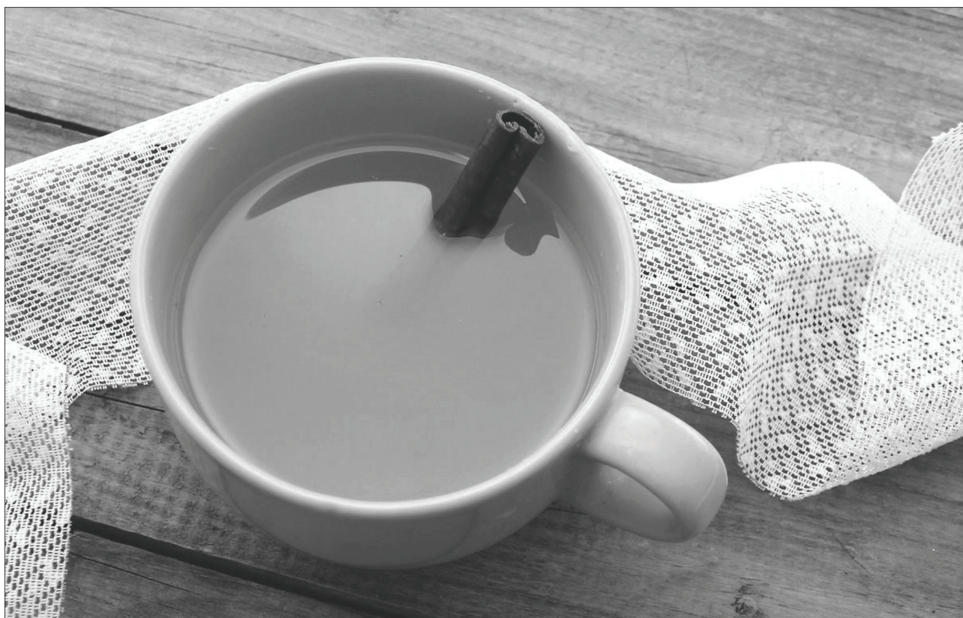
A mug of hot apple cider is a special treat on a cold day.