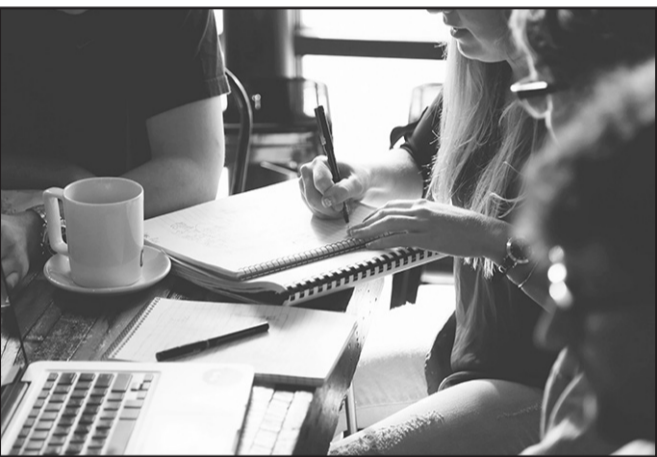
Agricultural producers and others who attend NDSU's Beginner's Guide to Grant Writing workshop will learn how to prepare and submit a professional grant proposal.