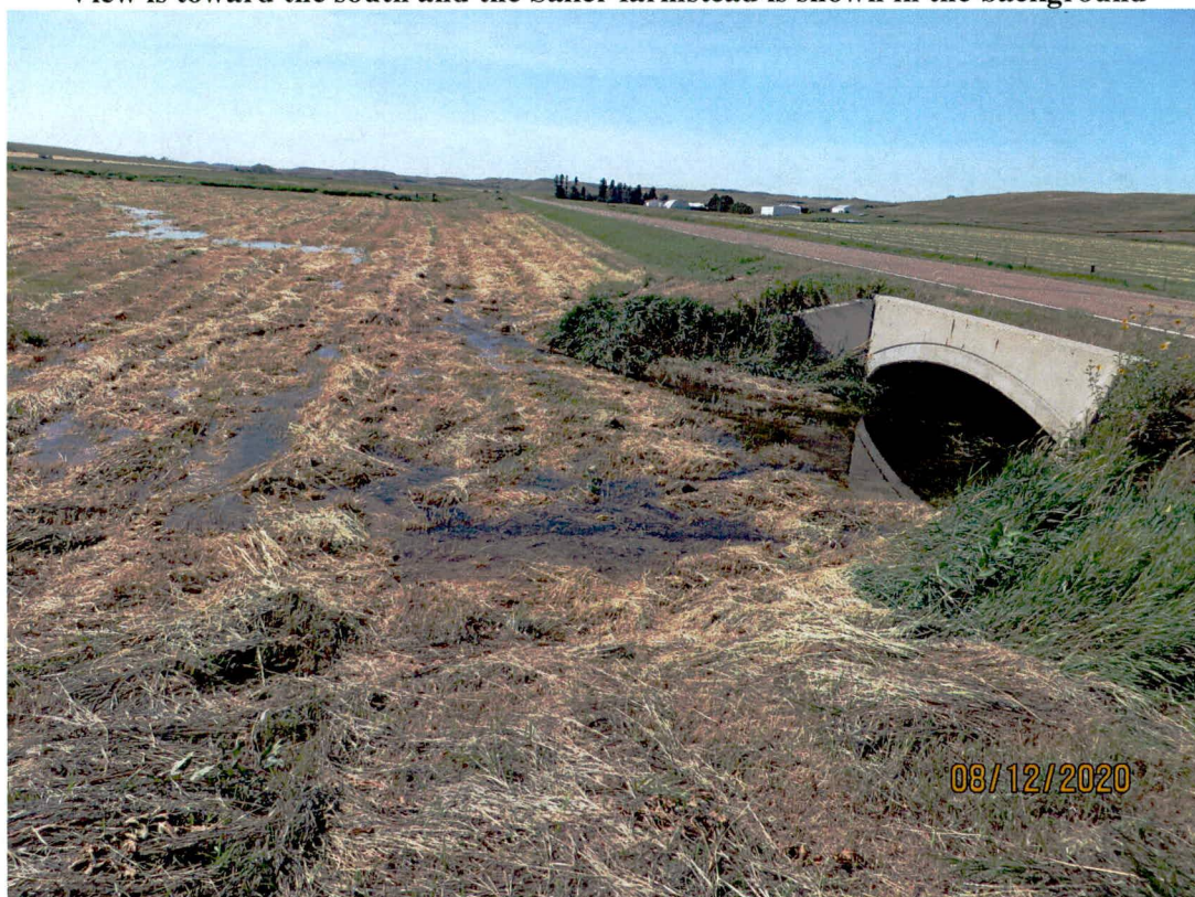
Figure 1. View of a portion of the flooded hayfield in the NW1/4 of Section 27 View is toward the south and the Sailer farmstead is shown in the background

Coteau records indicate that sediment pond P-W03-04 began discharges to the creek on July 21 and finished on July 25 with an average discharge flow rate of 515 GPM and a total discharge volume of 2.9 million gallons, or 8.9 acre-feet. More recently, Coteau began discharging water intermittently from sedimentation pond P-W11-01 between the dates of July 23 and August 12 with an average discharge flow rate of about 675 GPM and a total discharge volume of about 13.5 million gallons, or about 41.4 acre-feet. Sediment pond P-W11-01 is located in the NW1/4 of Section 11 in Coteau's mining permit NACT-0201 about 2.5 miles south of the flooded hayfield. Ms. Flath indicated that once Coteau became aware of the flooding hayfield situation by Ms. Sailer, Coteau personnel immediately terminated the discharge of sediment pond P-W11-01. Ms. Sailer reported she had received .60 inches of rain at her farmstead on August 11 th , which is located about 1/4 mile south of the hayfield in the SW1/4 of Section 27 and Coteau Properties reported they had received .87 inches of rain on August 11 th . It appeared to us the precipitation received had mostly infiltrated into the soil because we were able to easily drive around the hayfield, and the ground was generally dry except in the areas where the creek water overtopped its bank.