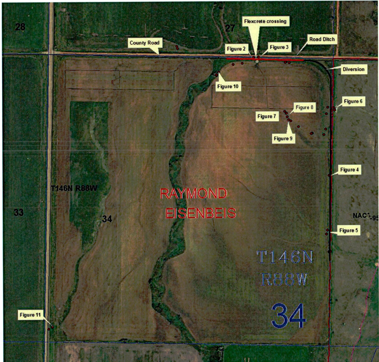
Figure 1. Location of the diversion, road ditch, Flexcrete crossing and photographs taken in the NW¼ of Section 34