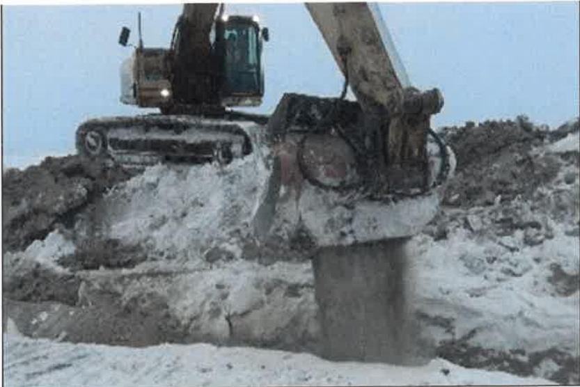
Shaker Equipment Backfilling Trench

A decision-making chain is necessary for determining if work on the construction right-of-way should occur in frozen weather conditions due to changing conditions.