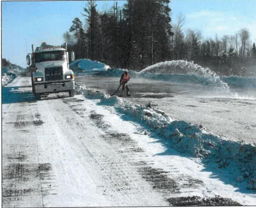
Building the Ice Road

Once the frost road is established, it should be maintained by removing or compacting additional snowfalls to prevent development of an insulating cover as well as to maintain equipment travel. A layer of snow should be kept on the frost road to reflect the sun's energy and minimize thawing during warmer periods of the day. Darker areas of exposed soil can absorb heat and accelerate thawing, reducing the length of time the frost road can be safely used. Bare spots should be covered with snow as soon as possible.