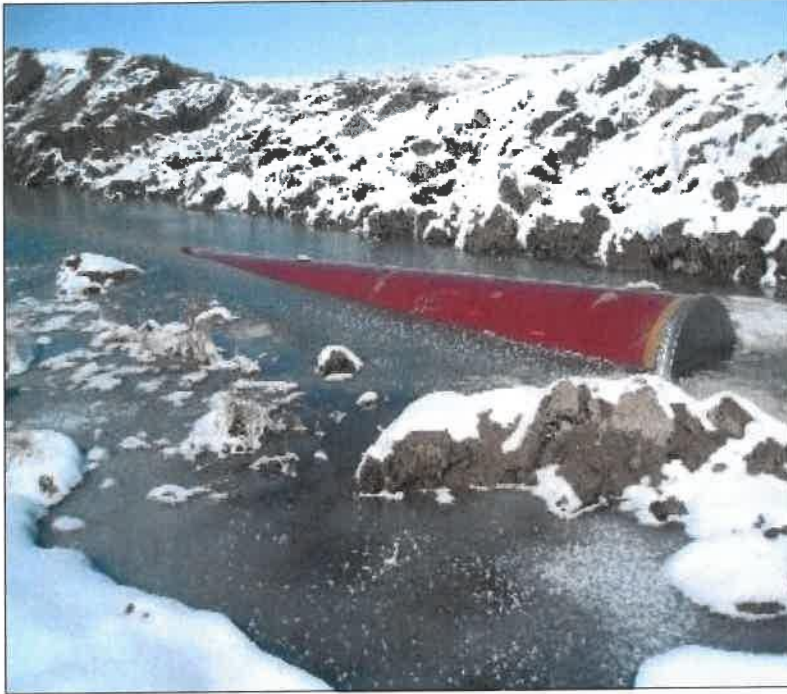
Trench With Frozen Infiltrated Groundwater

Equipment Care: Freezing conditions make operating equipment outdoors more difficult. Lubricants and other liquids in pumps can freeze up and not operate. Plans should consider measures to ensure equipment is protected from the elements and operational prior to use. When dewatering during freezing conditions, pumps may have to be installed in small, heated shelters to prevent the pumps from freezing and becoming non-operational or causing damage to the pumps that could result in a spill or leak of lubricants or fuel. The use of anti-freeze liquids in the pump housing is not recommended due to the difficulty of removing the potentially hazardous liquids prior to the re-use of the pumps.