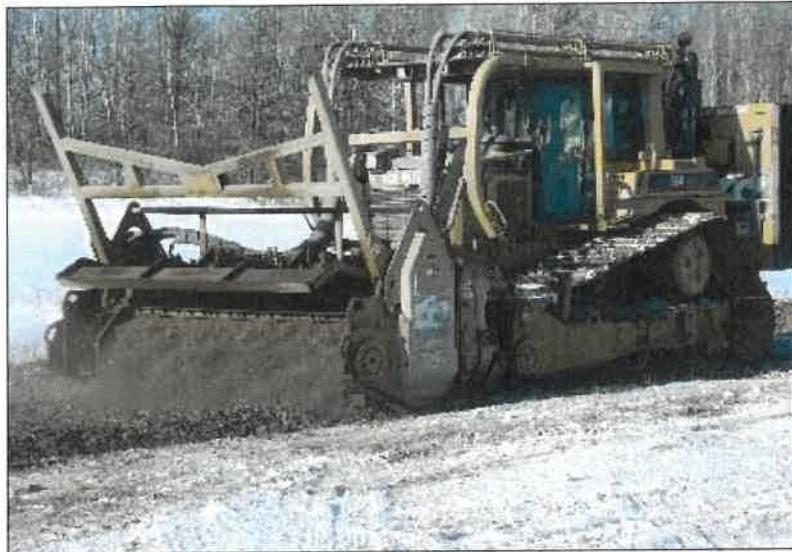
Iron Wolf Breaking up Frozen Topsoil

Topsoil Removal: Topsoil segregation should be completed prior to frozen soil conditions where practicable in areas with long periods of frozen conditions. When the topsoil is frozen at the time of topsoil stripping, multiple passes (vs. a single pass) with a bulldozer or other specialized equipment may be necessary to remove only the topsoil and not the subsoil. Specialized equipment (e.g., soil rippers) may be necessary to break up the topsoil prior to removal. An “Iron Wolf” or pavement grinder can remove frozen topsoil; however, the use of this method should be reserved for special situations and in cooperation with landowners and regulatory agencies because this process can affect the native soil structure.