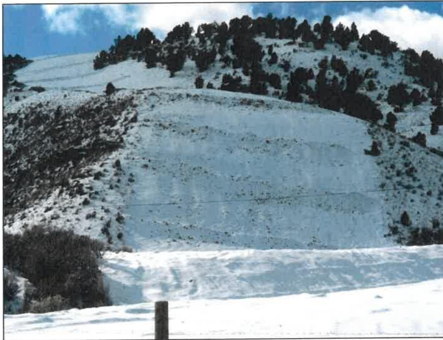
Right-of-Way Stabilized for Winter

Whether restoration is completed under frozen conditions or delayed until the spring or summer period, the right-of-way will require stabilization prior to the spring thaw. Seed intended for site stabilization or restoration will not germinate under frozen conditions, and therefore Companies should plan for alternative methods of site stabilization prior to the first spring rains (see Section 7.0, Temporary Erosion and Sediment