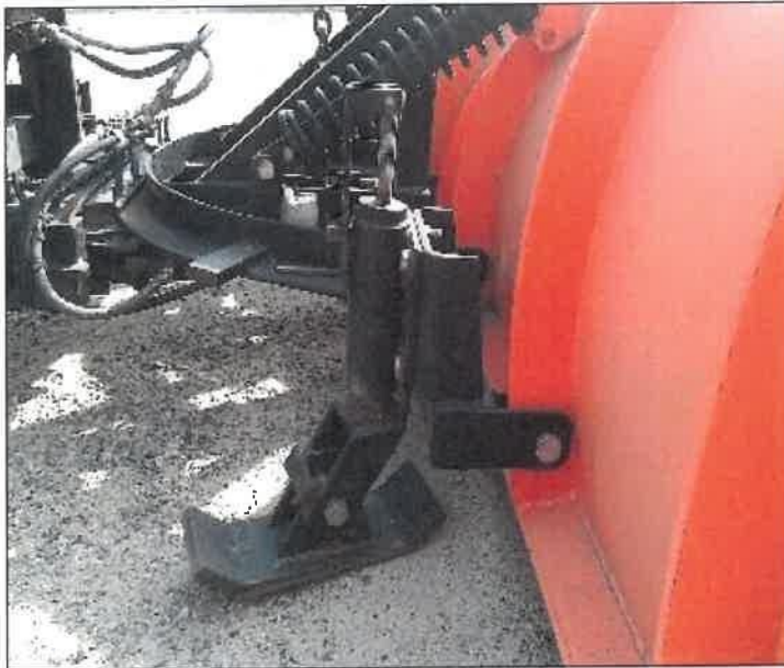
Equipment Modified With a Shoe

Snow removal activities should be monitored by the Environmental Inspector.