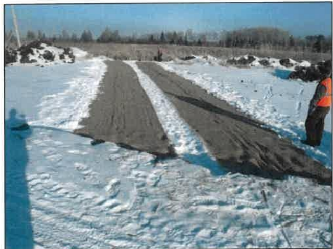
Stabilization of the Right-of-Way

Timing of Restoration: Determine whether the project will be completely restored or if restoration will be delayed until after the spring thaw. Backfill all areas of open excavation or provide safety fencing and signage for protection. If restoration will be delayed, consider leaving the subsoil in a roughened condition to slow the sheet flow of water. After restoration, restore contours for drainage to preconstruction conditions. Delaying seeding can also result in the development of noxious weeds that require treatment, such as the application of herbicides, prior to additional seeding and other restoration activities.