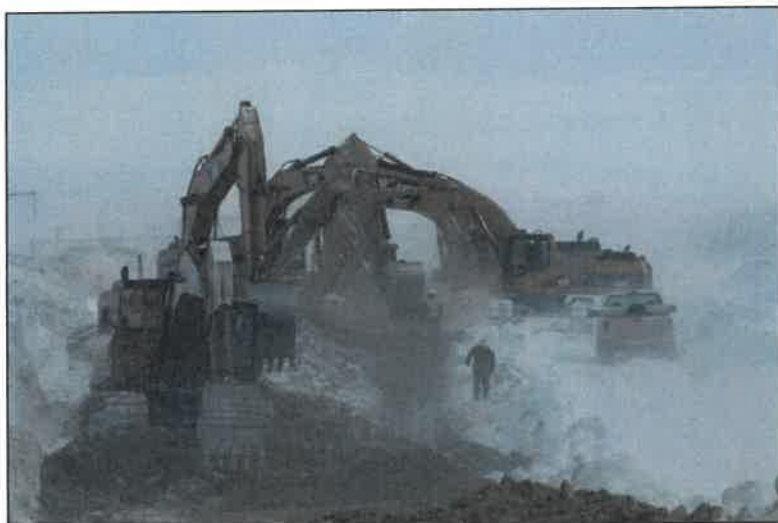
Pipeline Construction in Frozen Conditions

In a March 2013 report on United States natural gas pipeline capacity, the U.S. Energy Information Administration (EIA) noted that “more than half of new pipeline projects that entered commercial service in 2012 were in the Northeast.” 1 Elsewhere on the EIA’s website, data show that the number of producing gas wells in the United States has increased by 36 percent from 2001 to 2011. 2 This number includes an increase in producing gas wells of 36 percent in Pennsylvania and Colorado and 152 percent in North Dakota over the same