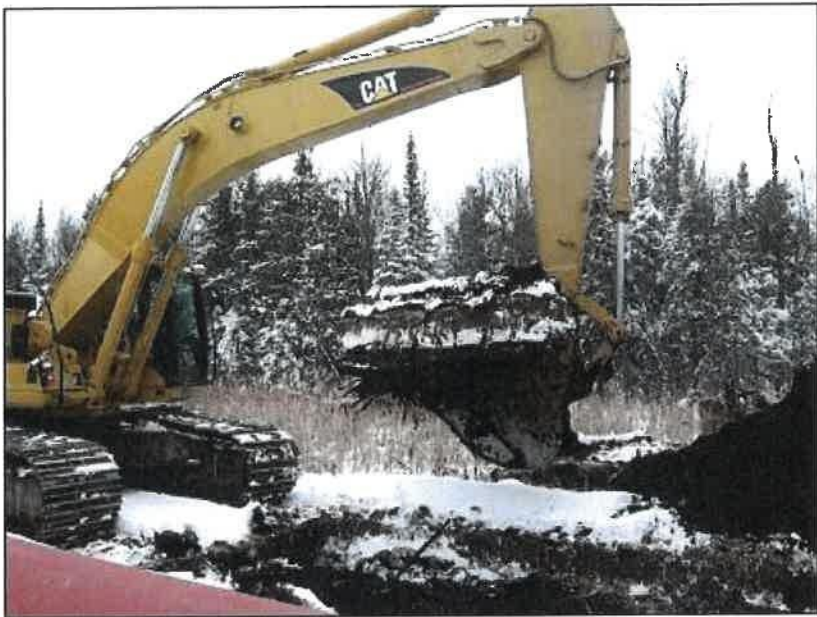
Segregating Frozen Topsoil Layer in Wetland

Construction through wetlands and other wet areas presents its own unique challenges, such as wheel rutting and mixing of soils, impacts to plants and other species, and downtime from construction equipment becoming stuck in loose or saturated soils. The following elements contribute to the challenges inherent in crossing and restoring wetlands and waterbodies and are addressed in this section: soil types, extent of freezing, topsoil segregation requirements, open ditch limitations, and trench subsidence and crowning.