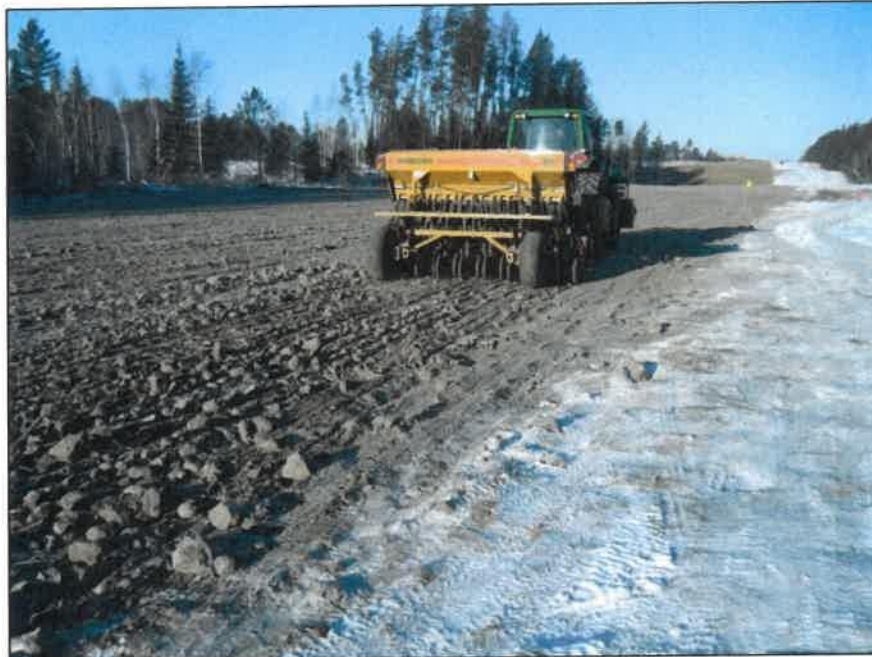
Drill Seeder in Upland Area

Landowners: The plan should emphasize the importance of communicating with landowners throughout frozen conditions about construction activities, construction shut downs, restoration of the right-of-way and cleanup activities timing. It is important to address their expectations for the overall timeframe for construction and restoration activities and for access across the right-of-way at all phases of construction considering that winter construction often extends the overall period of disturbance.