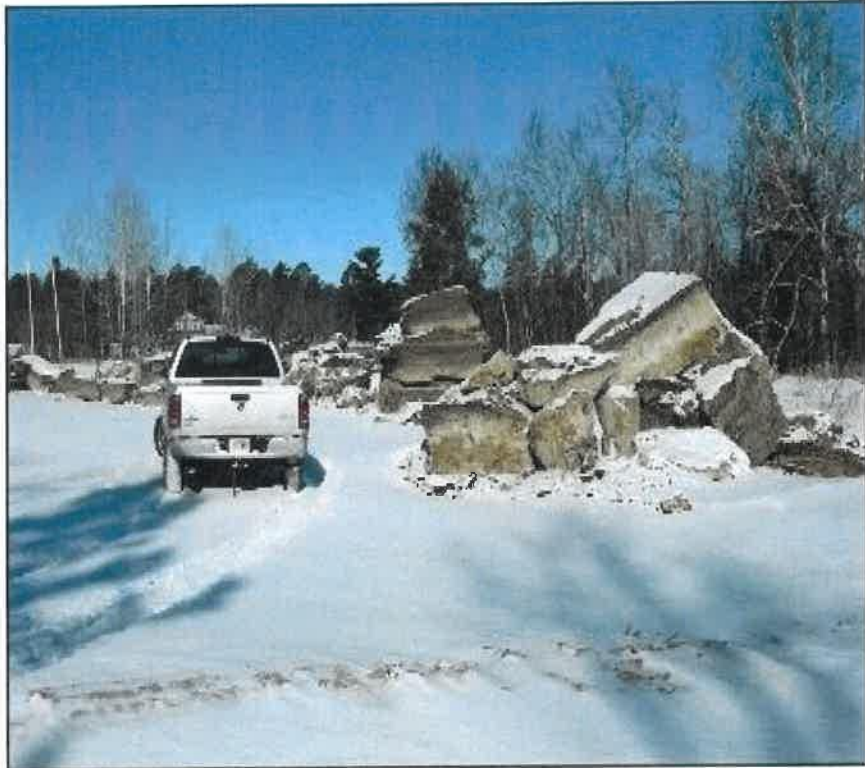
Topsail Frozen to Subsoil

Frozen soil conditions in upland (unsaturated, non-wetland) areas can create a firm working surface with a low potential for topsoil mixing. Planning to construct over frozen soils could be a factor in determining how large of an area over which to segregate topsoil. However, frozen conditions are not always consistent and intermittent thaws can occur depending on the location or annual variations in cool season temperatures. Construction or restoration work could extend into the spring thaw period due to unanticipated schedule slowdowns or an unseasonably early thaw period.