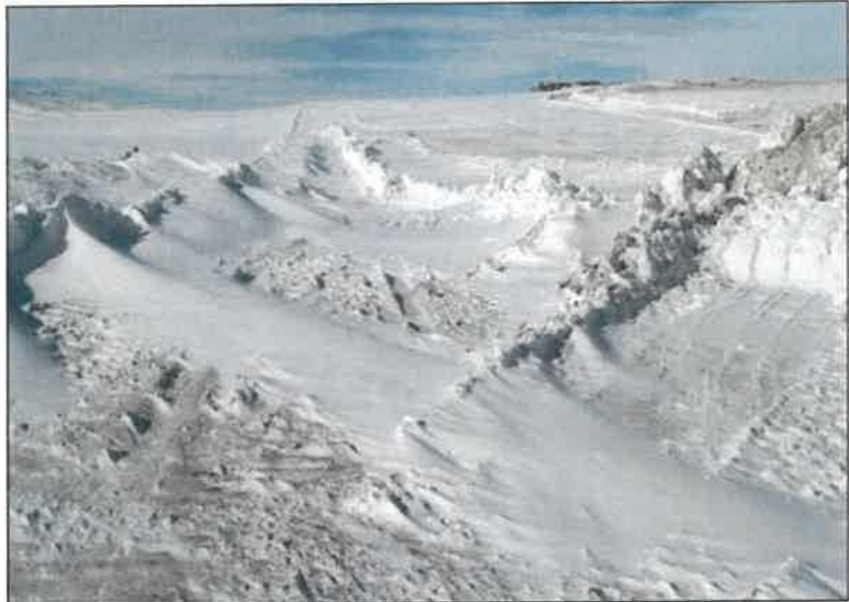
Snow Covered Right-of-Way

Significant snow fall events before or during construction can create unsafe work conditions and make it difficult to complete the job properly. Removal of snow from the construction workspace may be necessary to provide safe and efficient working conditions and to expose soils for grading and excavation. Snow may also need to be removed along access roads to allow safe access to the right-of-way.