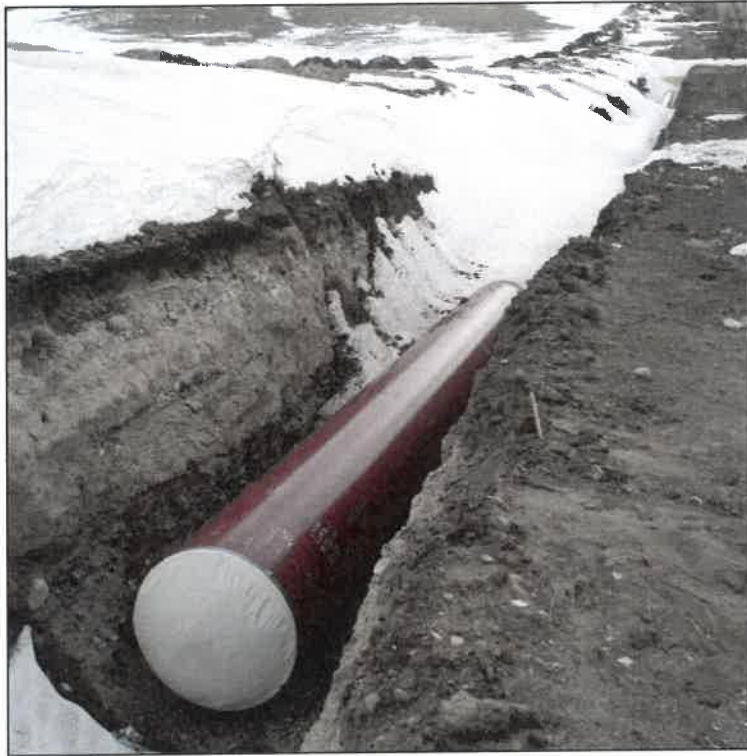
Pipeline Construction in Frozen Conditions

indicated for a given project. The FERC's recommendations recognize the increasing incidence of natural gas pipeline construction during winter months and under frozen conditions, especially in the northern, northeastern, and Rocky Mountain regions.