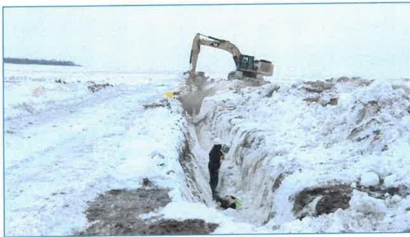
Snow Removal From Trench

The guidelines presented herein focus on construction and environmental protection practices unique to frozen conditions. These guidelines primarily focus on providing additional information to Companies regarding what to consider when developing a project-specific frozen conditions plan and what past practices have been successful under frozen conditions. In this way, the guidance presented in this document may also be used by Companies to develop project-specific plans based on each project's unique location, timing, and other variables.