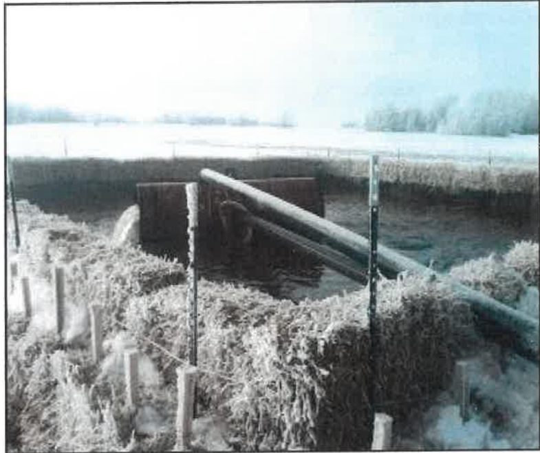
Hydrostatic Test Water Discharge Structure

The management of water is an essential factor of pipeline construction. All new pipelines require the use of water to perform hydrostatic testing prior to placing the line into service. In addition, depending on such project-specific factors as geography, climate, and season, open trenches may fill with water from rain events or from the presence of groundwater. Water in the trench must often be removed (trench dewatering) to prevent the trench sidewalls from collapsing or otherwise to maintain trench or backfill integrity prior to or during pipe installation and restoration. All of these activities can become difficult at best, and dangerous at worst, during sustained frozen conditions.