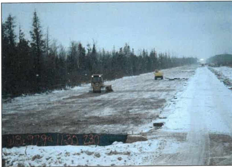
Preparing the Right-of-Way

Advance Planning with the Landowner: Prior to construction, land agents should address snow removal and storage with landowners. Items to discuss with landowners include snow removal equipment, snow storage areas, and existing features (gates, fences, etc.). In the pre-planning phase, it is recommended that land agents identify and gain landowner approval for extra area off the approved right-of-way and along access roads to allow snow storage. Previous projects in northern climates have used additional