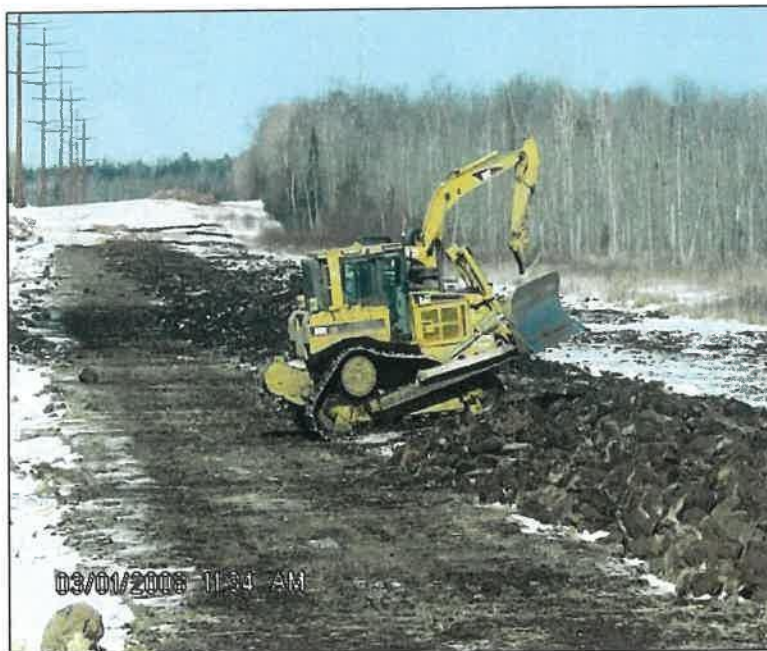
Reducing Frozen Crown Over Backfilled Trench

The crown should only be constructed directly over the backfilled trench with native material and should not extend out beyond the trenchline. Subsoil used to build the crown should not extend above natural surface grade. A crown should always be capped with native topsoil material to ensure elevations will be restored with topsoil at the surface. If the topsoil layer has been removed