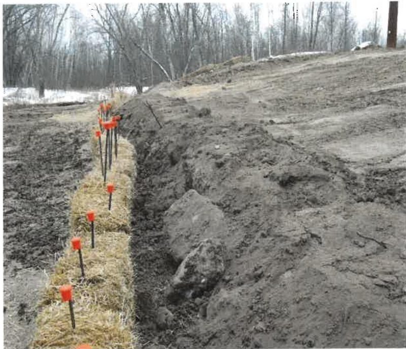
Erosion Control Devices With Protective Caps on Metal Stakes

Certain areas of the right-of-way may not be accessible during thawing periods or during the spring melt due to soft soil conditions, thus preventing regular inspections and hampering repairs or maintenance.