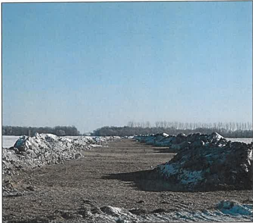
Right-of-Way Prepared for Final Stabilization

Monitoring Plan: If final cleanup and restoration activities have not occurred prior to the spring melt, monitoring of the right-of-way should be implemented during the delay between construction and restoration or temporary shutdown of construction activities. The monitoring program should identify: (1) erosion control structures requiring repair; (2) areas of slope instability; and (3) areas where significant levels of erosion are occurring. The EI should determine the most effective means of dealing with identified problems, taking into consideration the suitability of the right-of-way for access by equipment, potential damage that could occur by equipment accessing the right-of-way, and the urgency/significance of the problem. Road restrictions and soft soils could limit access to the erosion controls requiring repair. Flyover inspections of areas that are inaccessible by wheeled vehicles or that are within or adjacent to a sensitive resource could be the most efficient method of conducting the inspection.