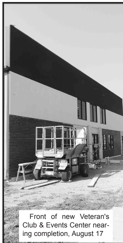
Front of new Veteran's Club & Events Center nearing completion, August 17