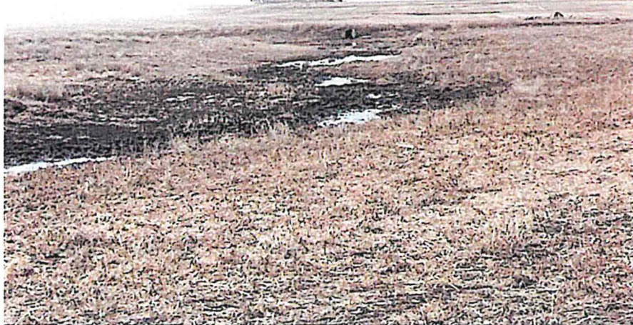
Looking South at drainage system and where culvert crosses 105 th St NW on the west side of 33 rd Ave NW