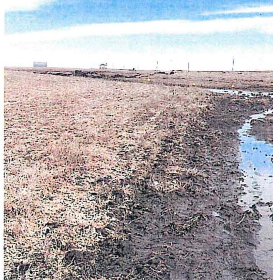
South side of pipeline where drainage system crosses 85A