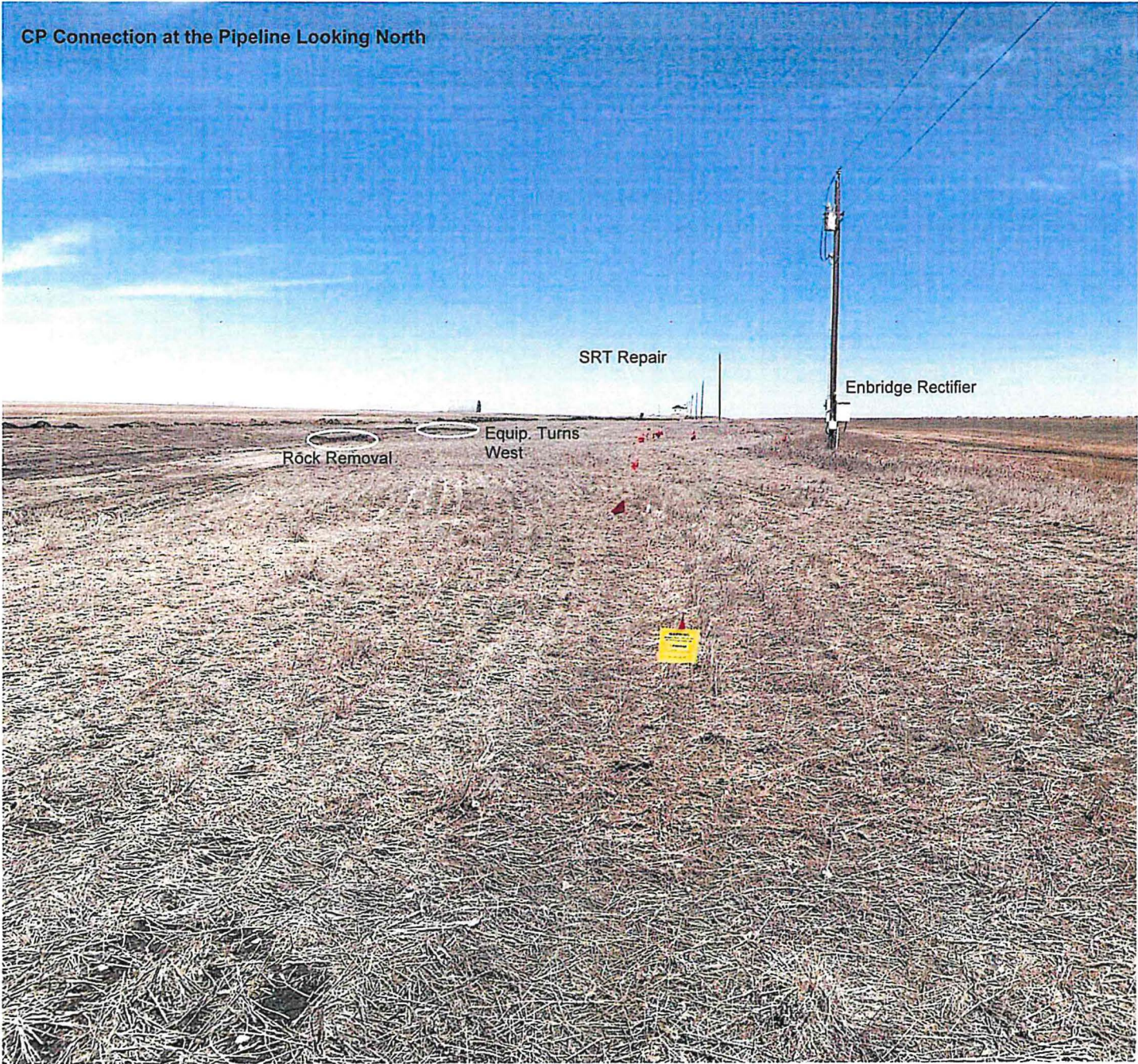
CP Connection at the Pipeline Looking North