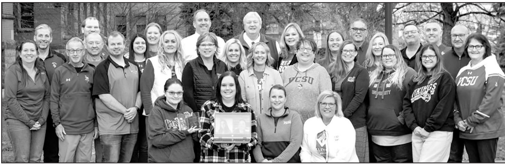
Valley City State University staff pictured above.

“Once again our School of Education continues to stand out as one of the top teacher-educator programs in the nation,” President