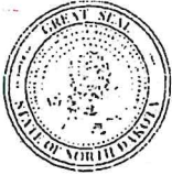
Exhibit F to Complaint