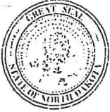
Exhibit F to Complaint