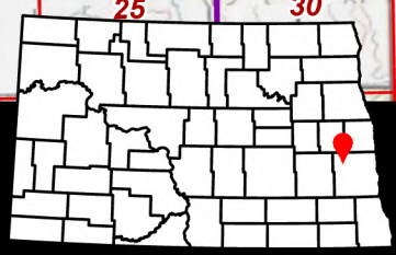
EXHIBIT A Prosperity Wind Cass County, North Dakota