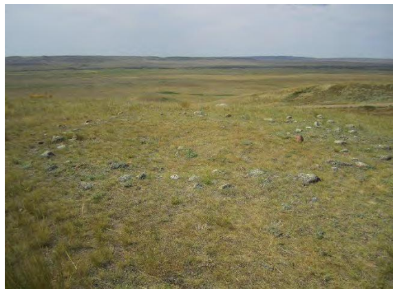
Stone Circle 2