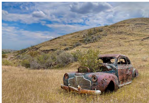
Abandoned Historic Vehicle 4