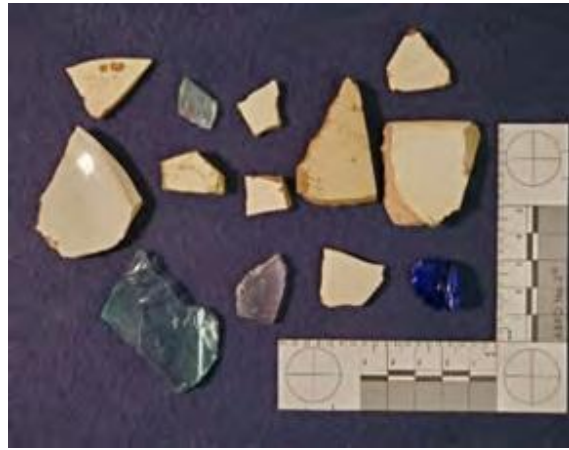
Homesteading Remnants (Historic Artifacts)