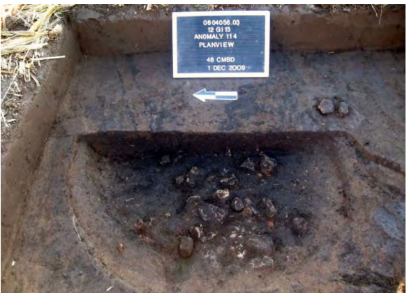
Darkly Stained Soil; Accumulation of Burned Rocks