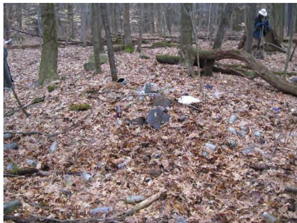
Cluster of Historic Cans and Bottles