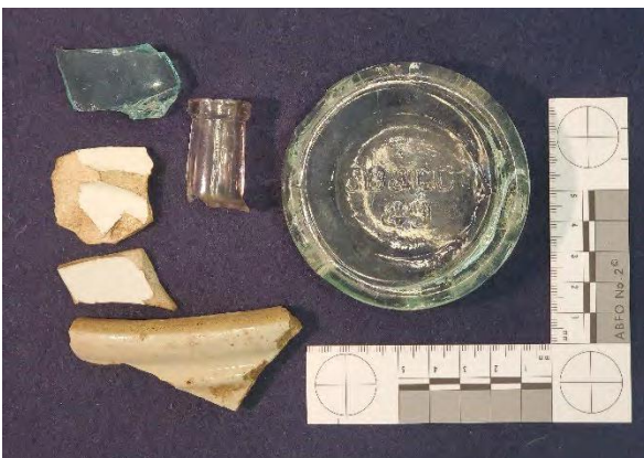
Homesteading Remnants (Historic Artifacts)