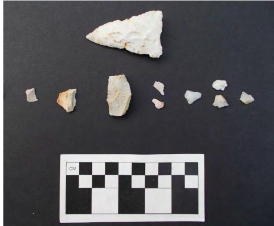
Stone Tool and Waste Flakes