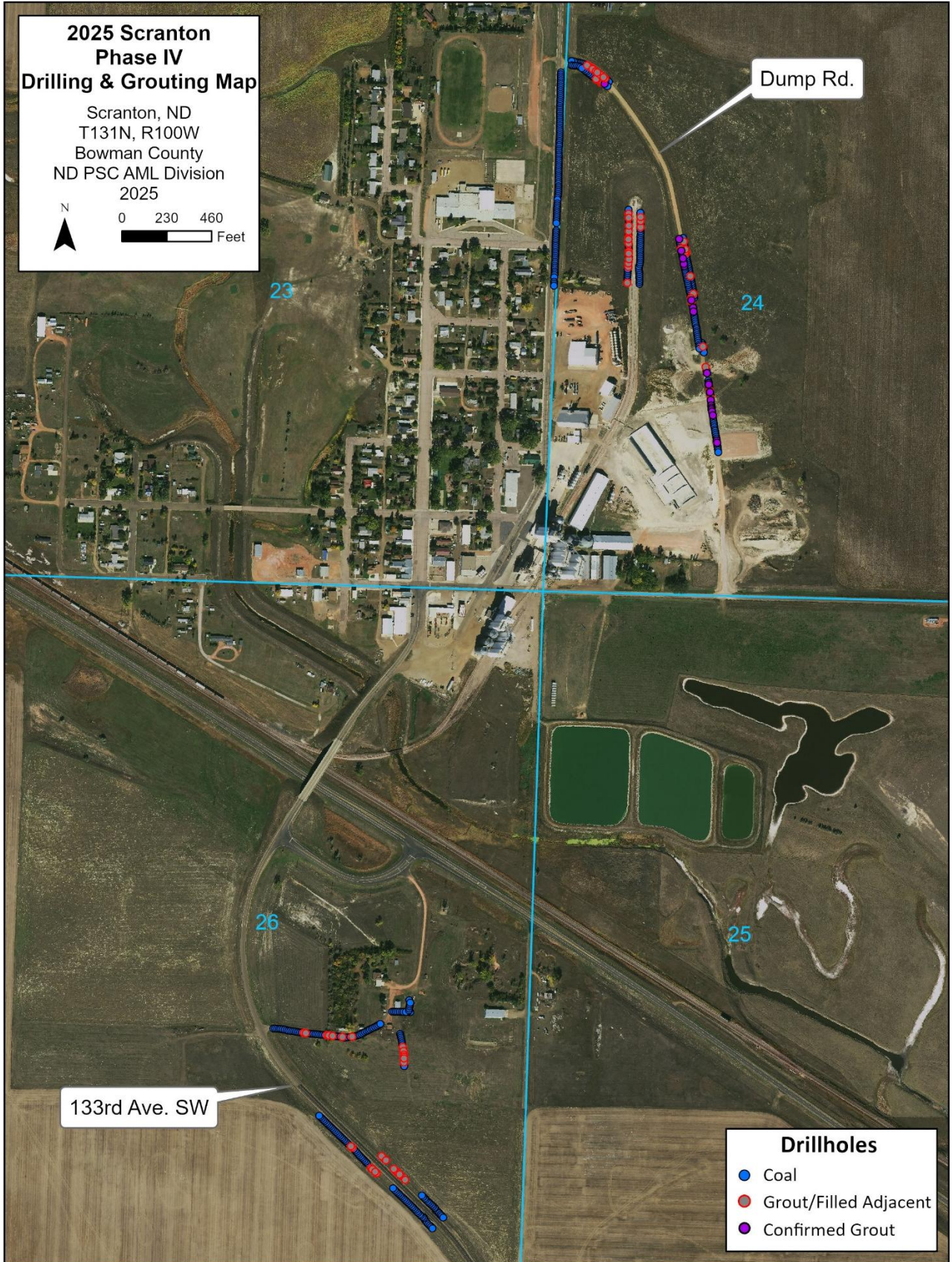
Figure 1: Scranton Project Drilling & Grouting Map