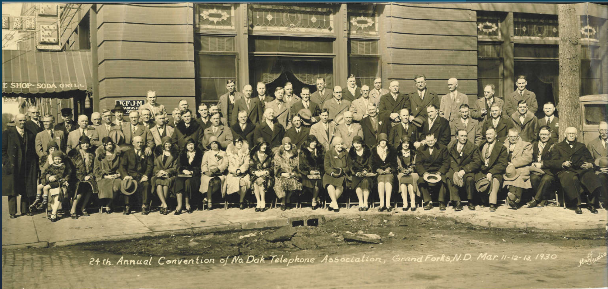
24th. Annual Convention of No. Dak. Telephone Association, Grand Forks, N.D. Mar. 11-12-13, 1930