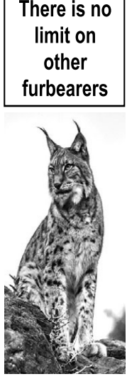
One per season - restricted

* Limits same except no bonus BWT may be taken