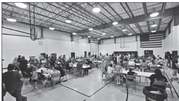
The Wyndmere Community Center was filled with families enjoying the back to school picnic on Tuesday evening.

Following the meal, student orientation was held in preparation for the first day of school.