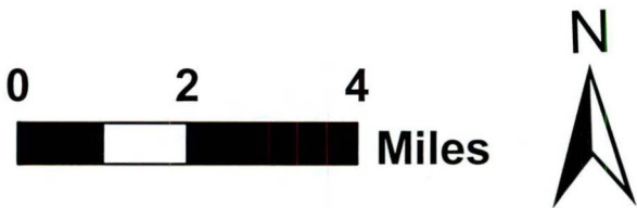
Project Location Map Bowman Wind Project Bowman County, North Dakota